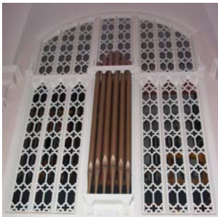
Facade with non-speaking pipes, identical on each side of the Chancel.