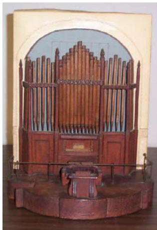
Wooden model of the original Odell organ.

The Central Presbyterian Church on Memorial Square in Chambersburg was built in 1868, on the site of a hotel burned during the Civil War. The first organ was built by Odell and comprised two manuals and some 20 ranks of pipes. In 1937 there was a disastrous fire at the church which burned off the roof and severely damaged the organ. Rebuilding began immediately and the rebuilt and remodeled church opened in 1940 complete with a new three-manual Casavant Pipe Organ.