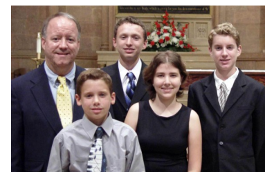
Four of our scholarship recipients pose with a Chapter member at a recital in 2005.