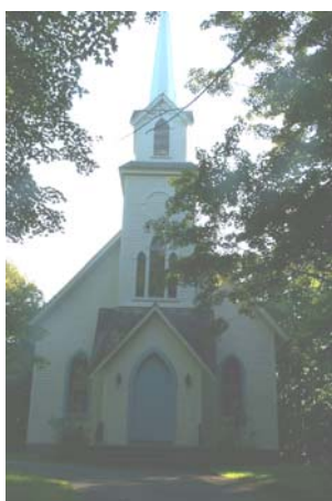
Haddam Neck Congregational Church